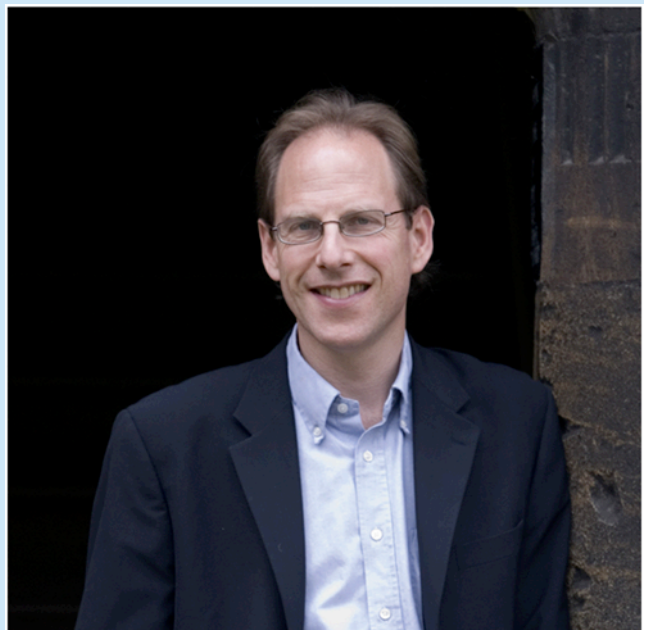
Figure 4. Simon Baron-Cohen. doi:10.1371/journal.pbio.1000114.g004

Thanks to a collaboration with a group in Denmark, Baron-Cohen now has access to enough amniotic fluid samples to ask whether children diagnosed with autism have elevated FT levels. He hopes to have the results next year, but is careful to point out that FT will likely be just one piece of a very complicated jigsaw. "We're still in early days," he says.